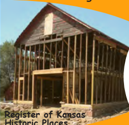
Register of Kansas Historic Places

Admission: Ages 2-12: $2 Ages 13 to adult: $5